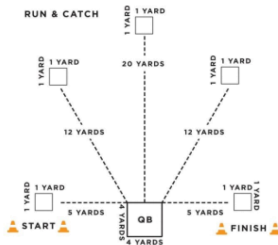
Figure M – Run, Catch, Throwing & Accuracy