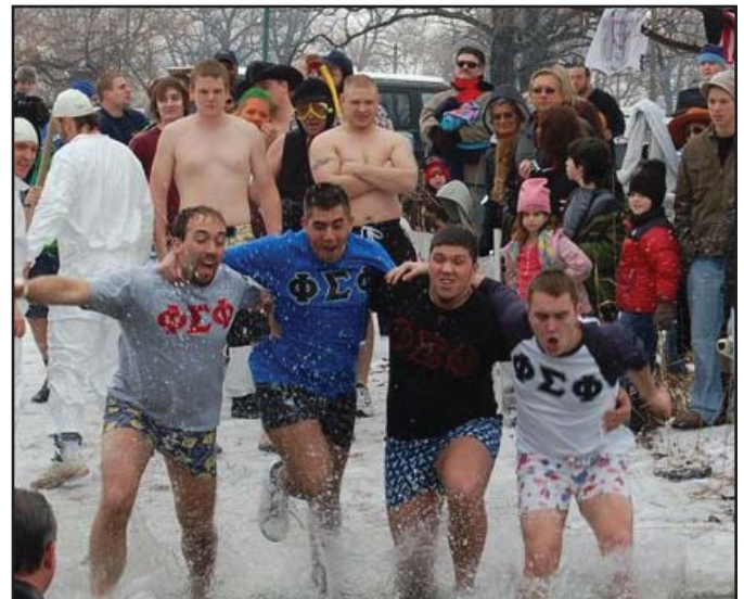
Nearly 90 participants took the plunge at the 2008 Law Enforcement Torch Run Polar Plunge into the Detroit River on Feb. 9 in Belle Isle.

This year, hundreds of people showed up at the Detroit Rowing Club in